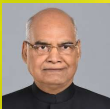
Visitor, Shri Ram Nath Kovind