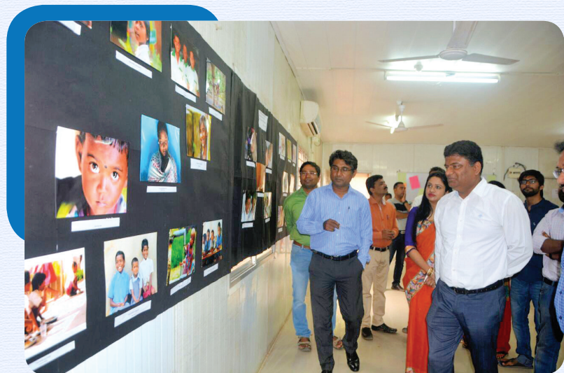
Photo Exhibition at CUJ