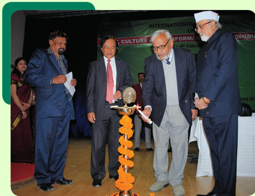
Dr. Syed Ahmed, Former Governor of Jharkhand Lighting a Lamp in International Conference