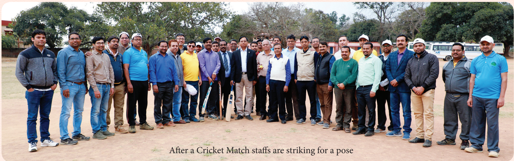
After a Cricket Match staffs are striking for a pose