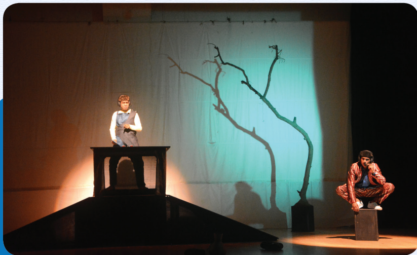
"Waiting for Godot" being staged at CUJ