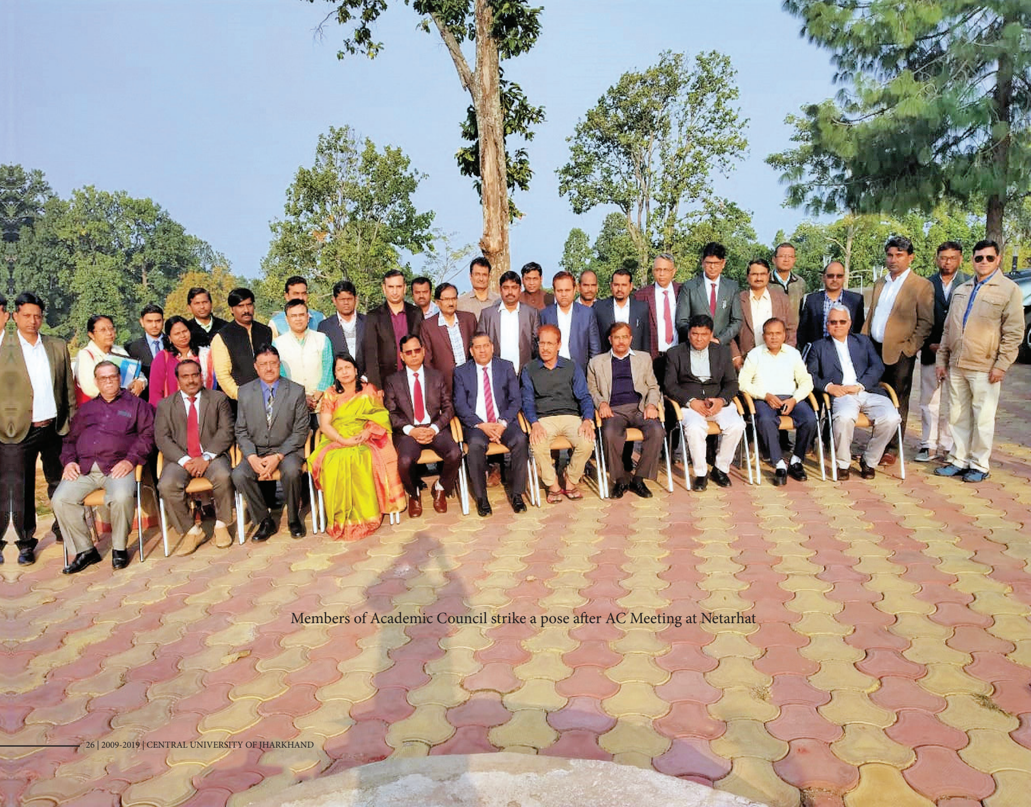
Members of Academic Council strike a pose after AC Meeting at Netarhat