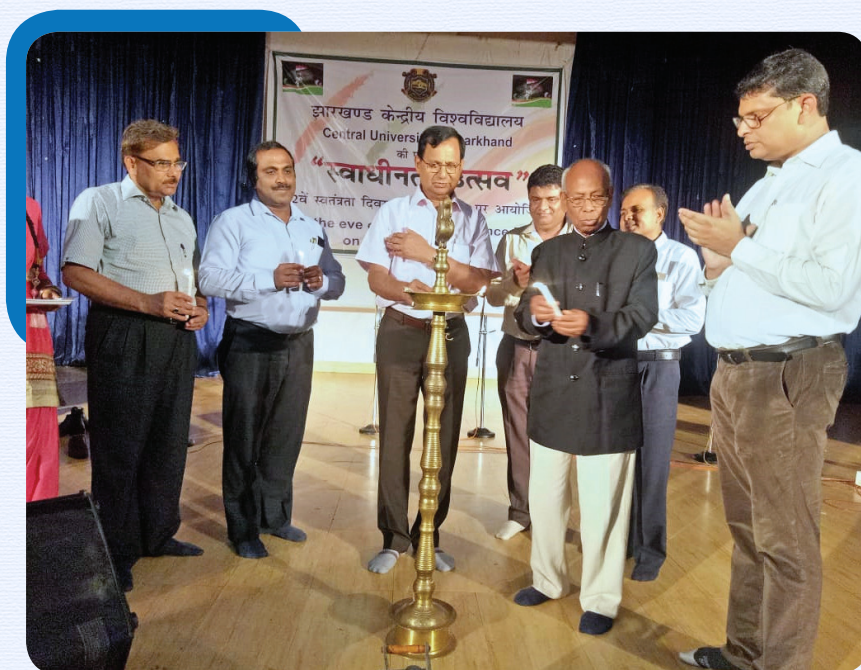
On the occasion of Swadhinata Diwas