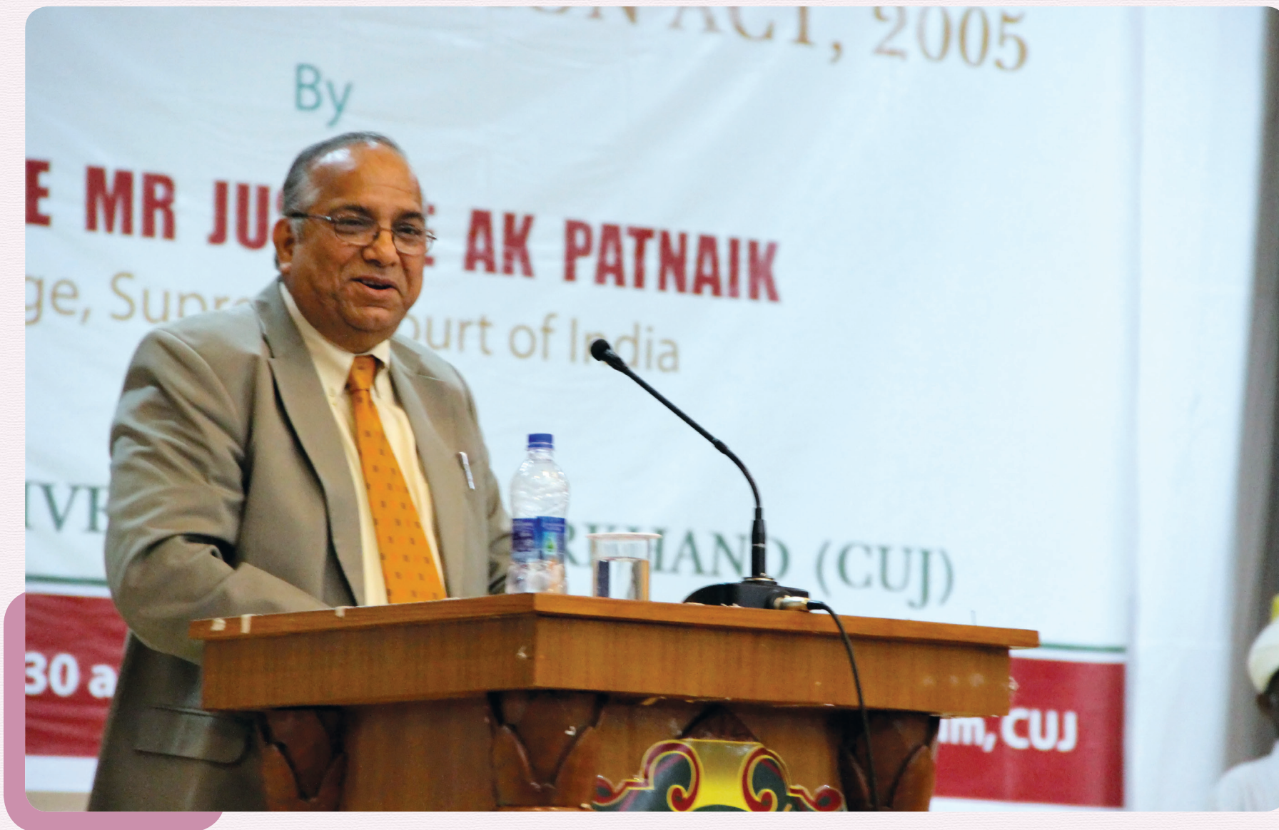
Justice A.K. Patnaik delivering a lecture on "Right to Information Act 2009"