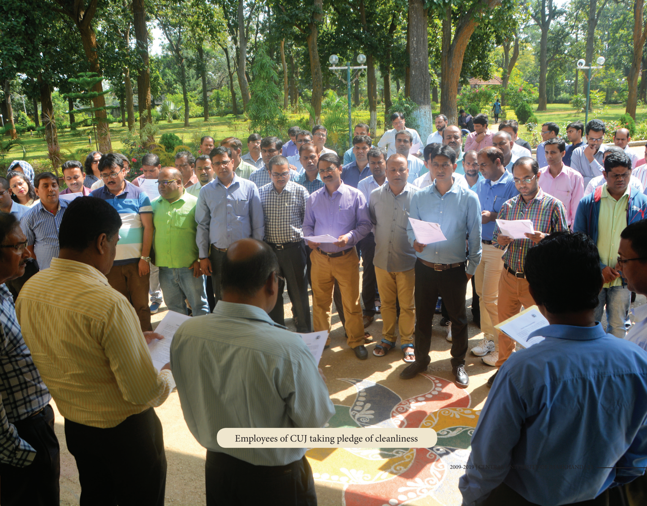
Employees of CUJ taking pledge of cleanliness