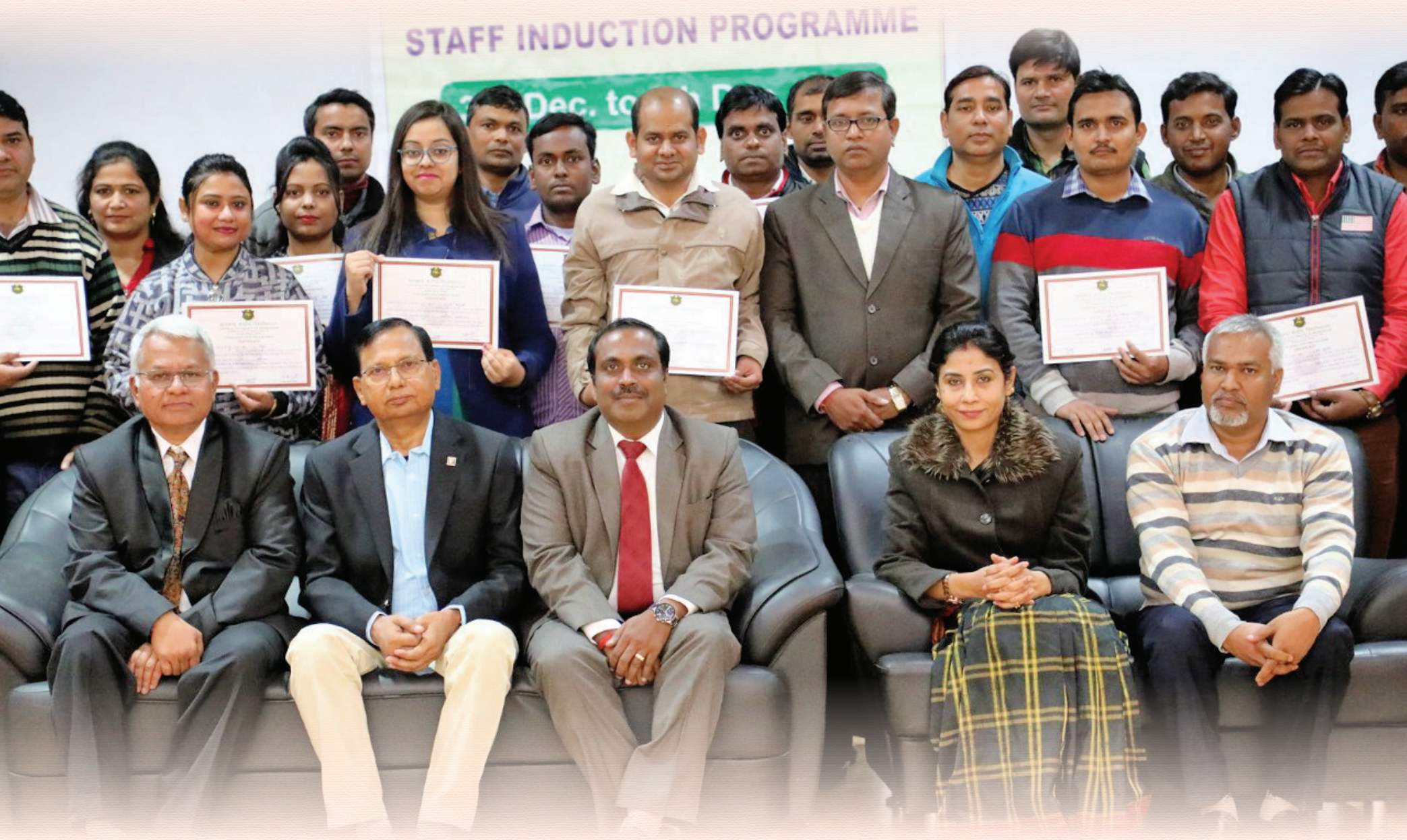
Staff Induction Programme organised at CUJ