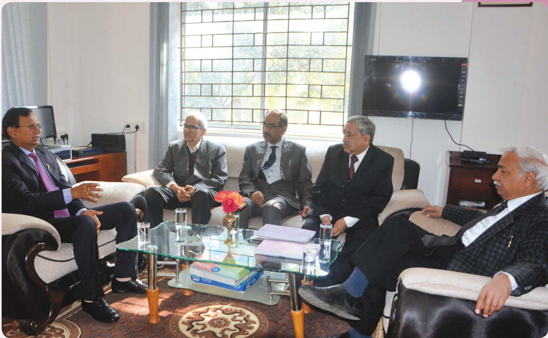
UGC Team visit at CUJ