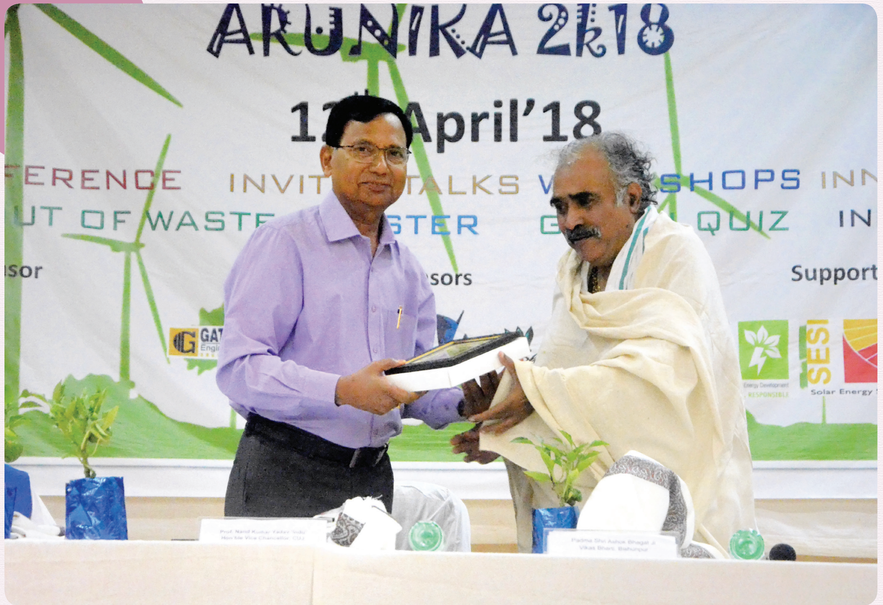
Padmashree Ashok Bhagat