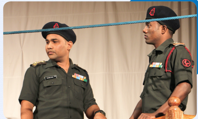
Stilt from the play "Court Marshal"