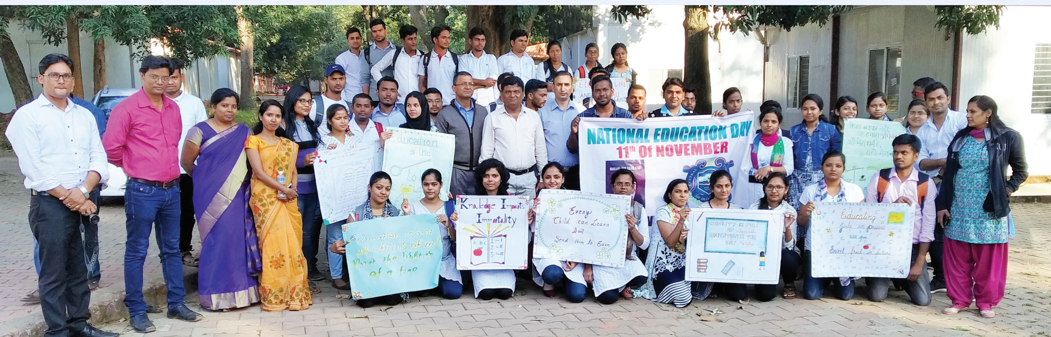
On the eve of National Education Day