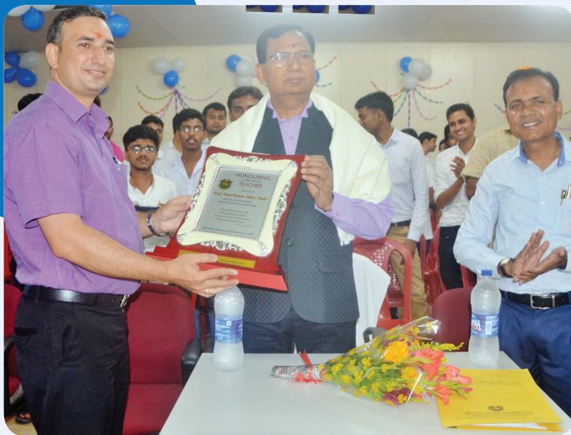
On the occasion of Teacher's Day