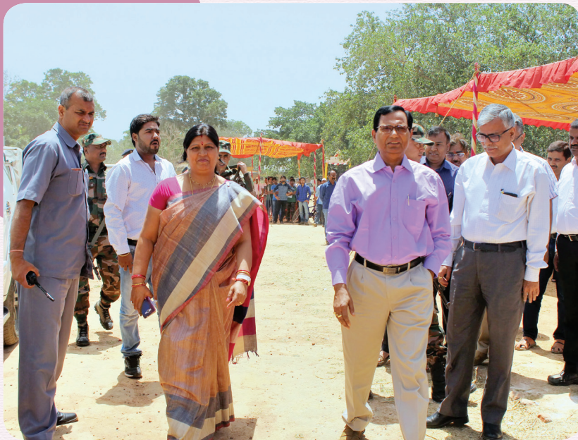
HRD Minister Smt. Neera Yadav's visit at CUJ