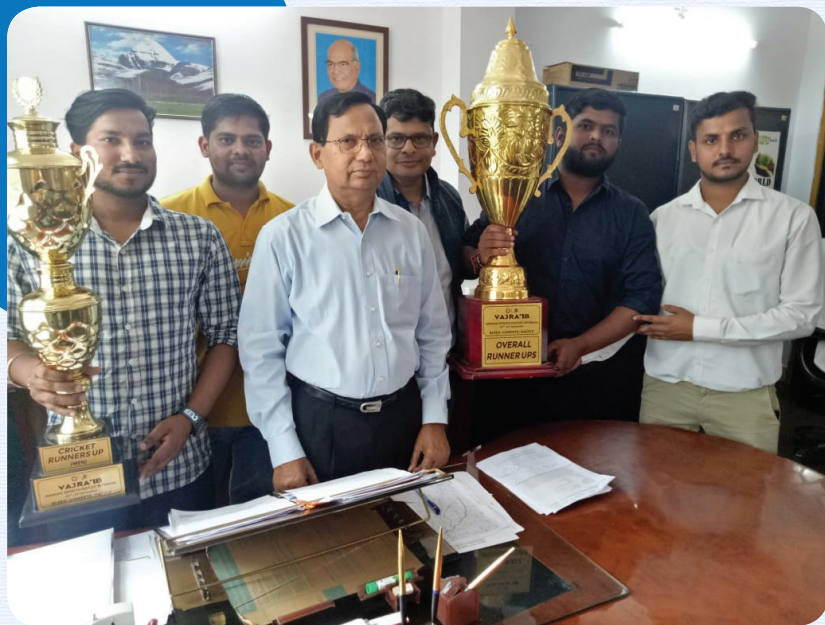
Winners of Cricket Team