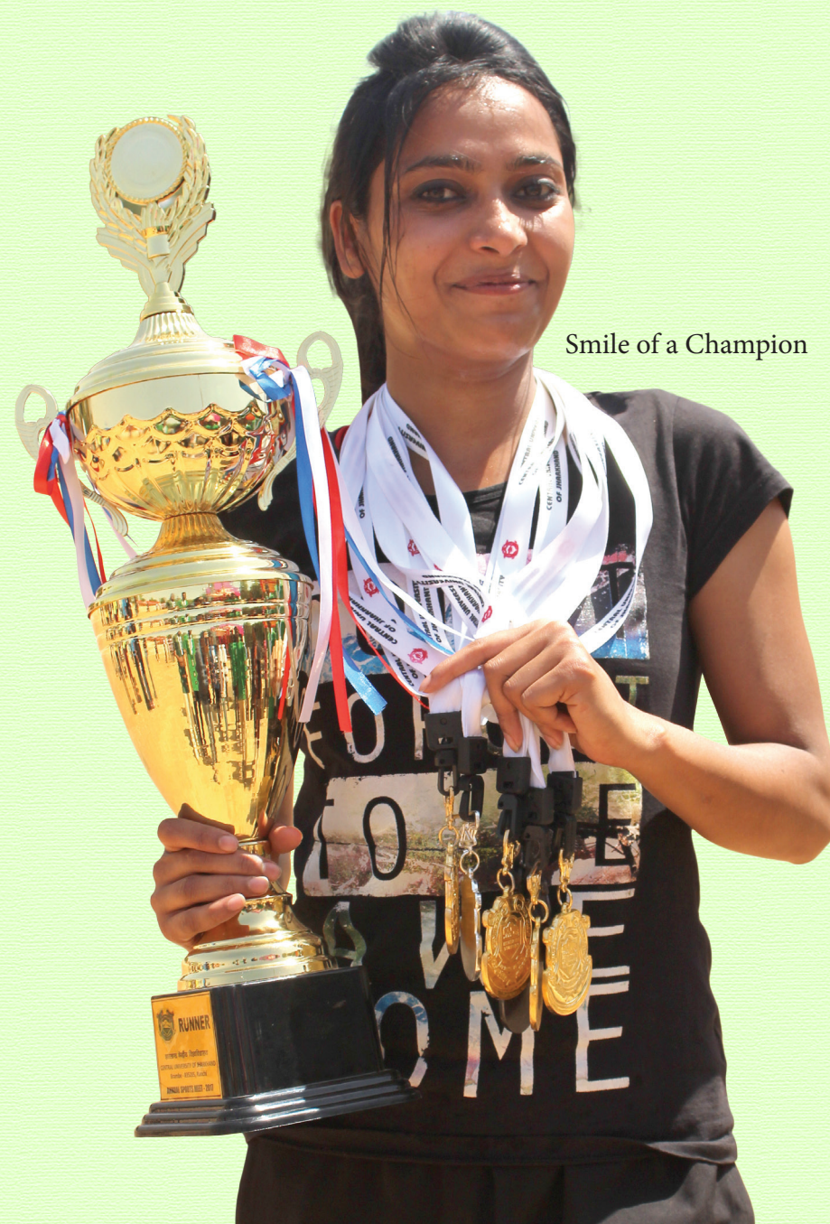
Smile of a Champion