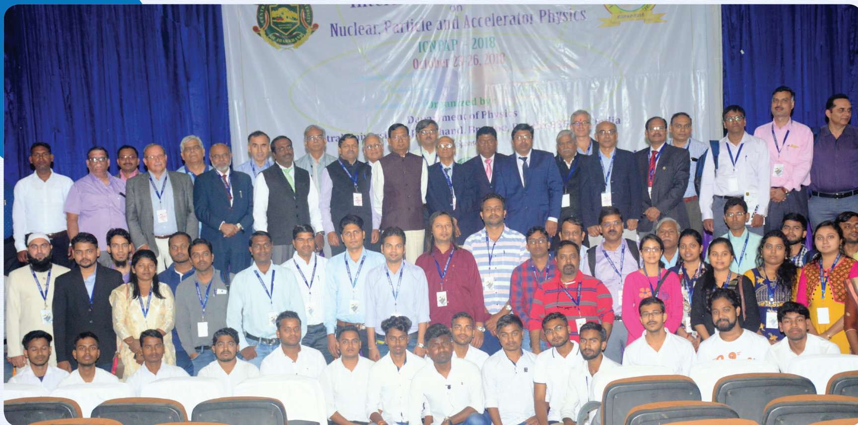
International Conference in the Department of Physics