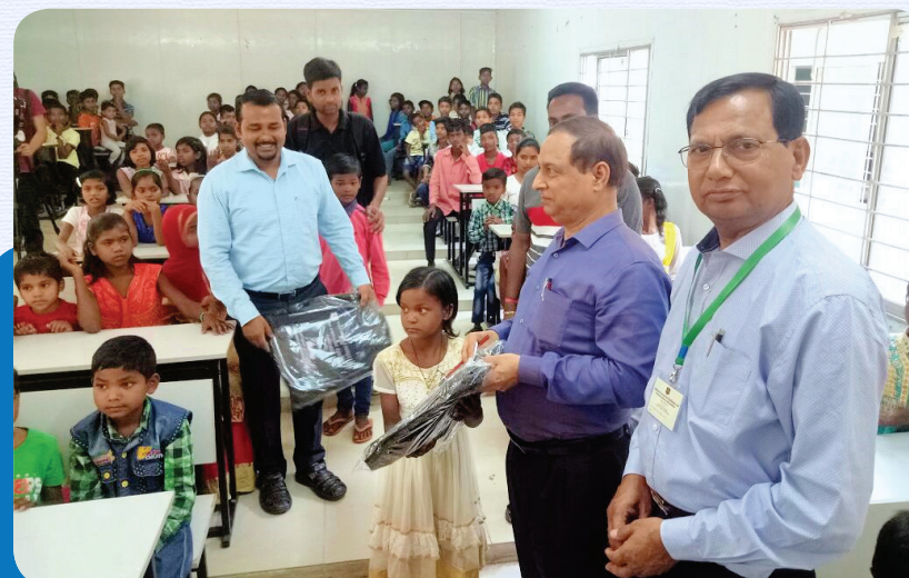
Kids of Unnayan