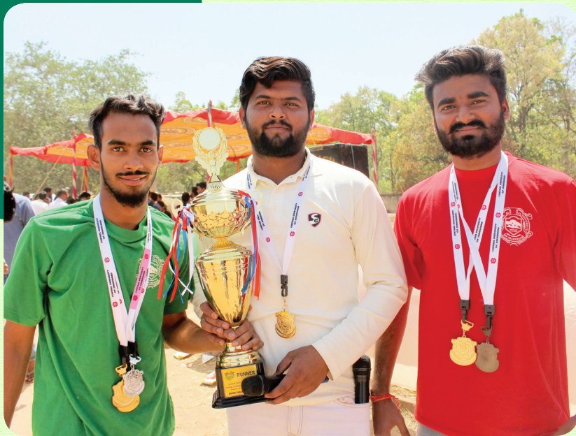
Winners in Khelotsav