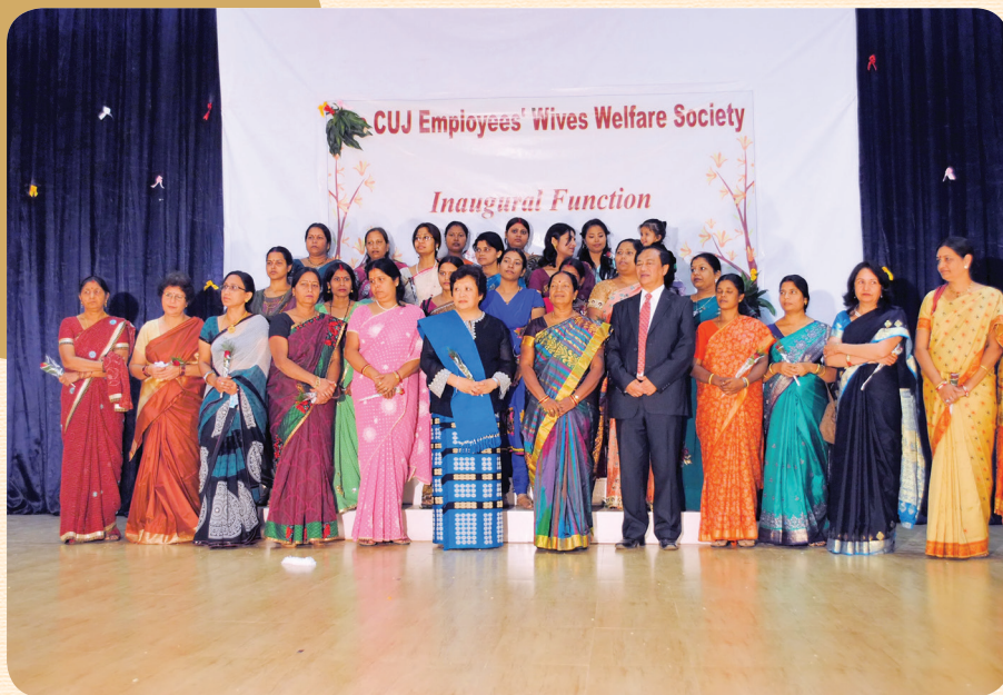
Foundation of CUJ Employees Wives Welfare Society