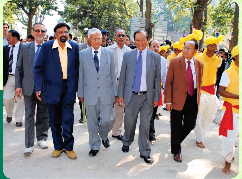
Taking a stride towards future