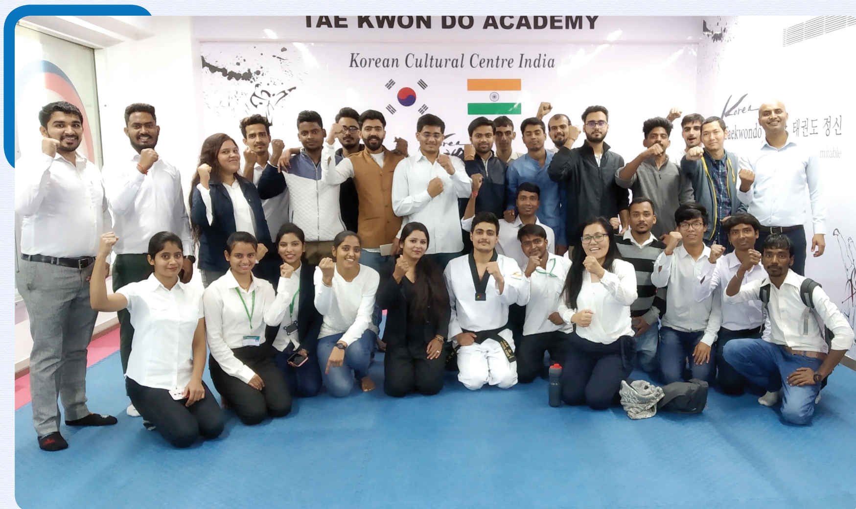
Students of Department of Far East Language (Korean)