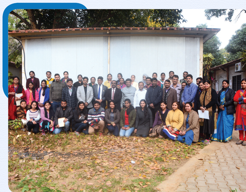
Training Programme at CUJ