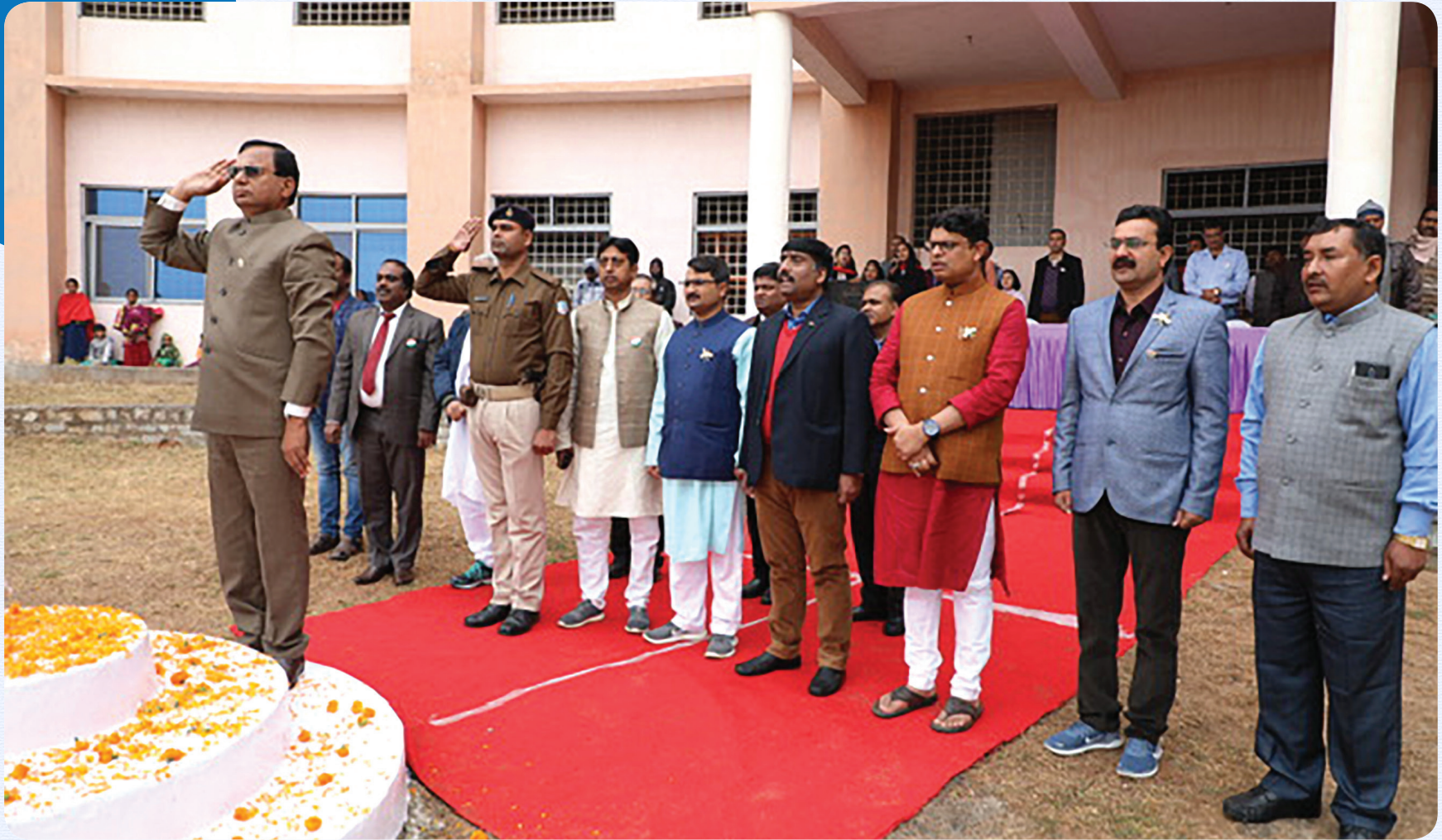
Flag Hoisting Ceremony on the Eve of Republic Day