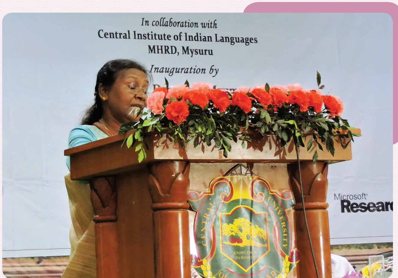
Smt. Draupati Murmu, Governor of Jharkhand delivering a speech on the significance of preserving tribal languages