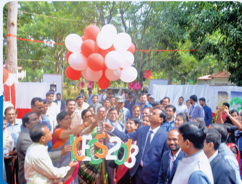
On the occasion of International Conference