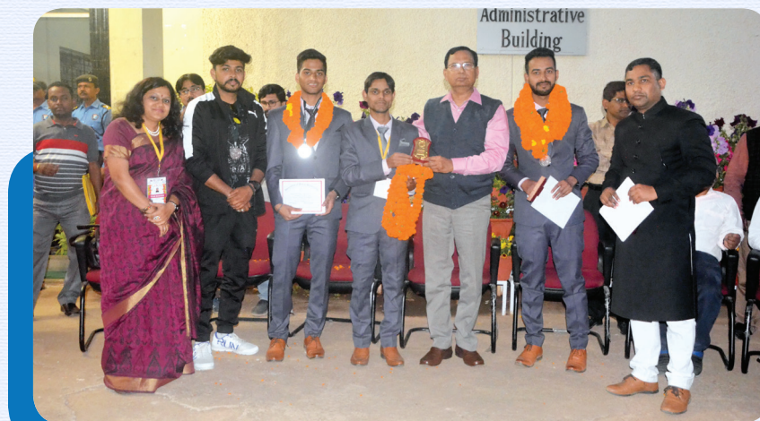
Achievers of National Youth Festival