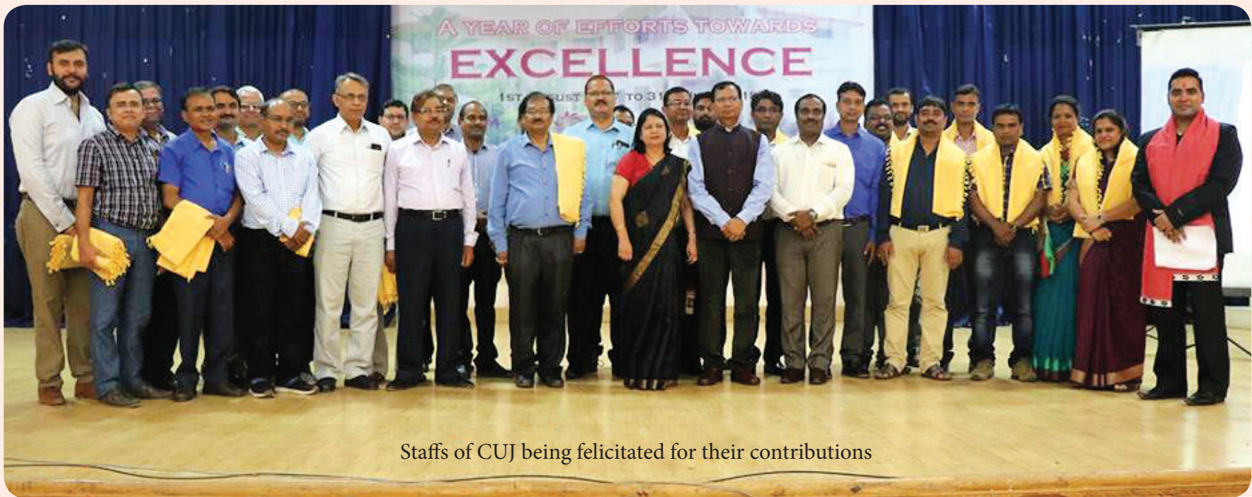
Staffs of CUJ being felicitated for their contributions