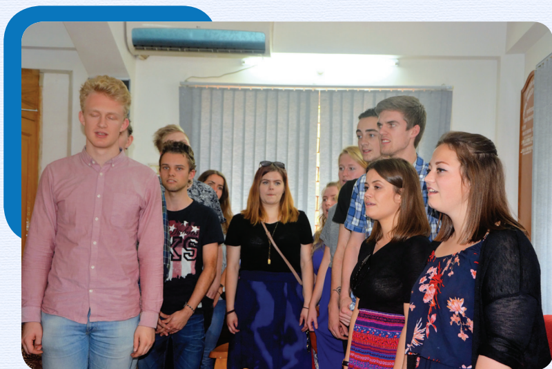
Students from Estonia attending Workshop at CUJ