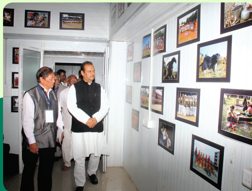
Former M.P. Mr. Subodh Kant Sahay taking a look in Photo Exhibition