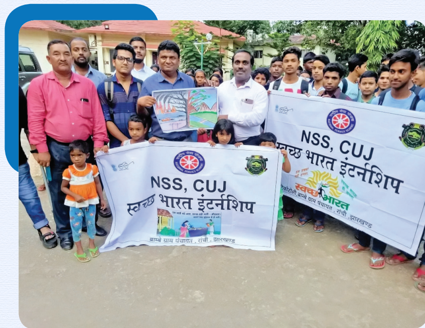
Programme of NSS, CUJ