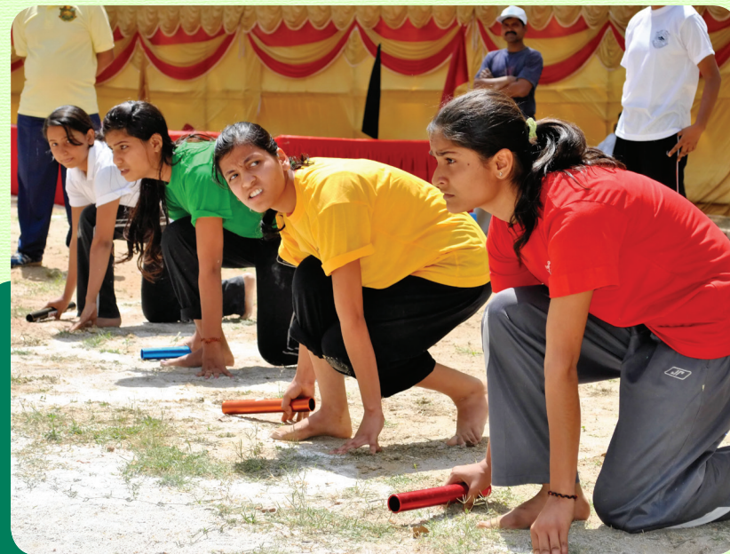
Get Set Go