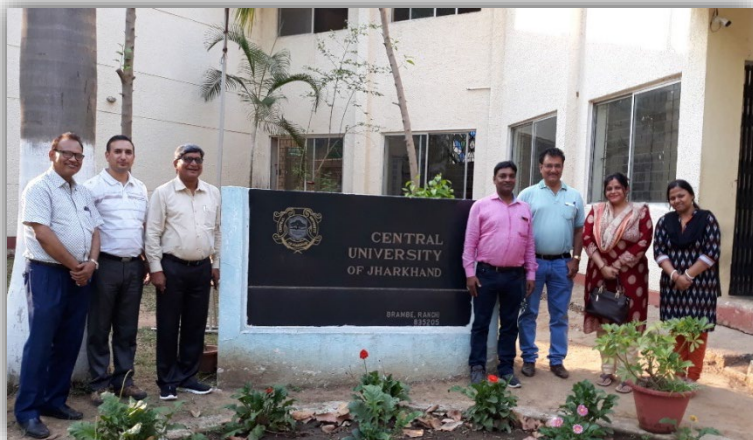
Placement team of Chinmaya Vidyalaya, Bokaro