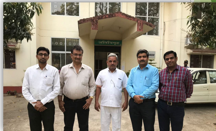
Placement team of Tagore Higher secondary school, Rajasthan