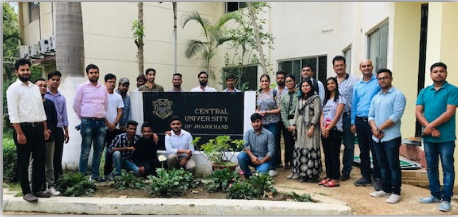
Oracle Placement Team with Korean students & DFEL Faculties, Placement Cell Chairperson