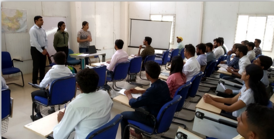
Oracle Placement Team with students of Chinese & Korean, interacting session after the written test