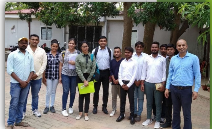
Oracle Placement Team with Chinese students & DFEL Faculties, Placement Cell Chairperson